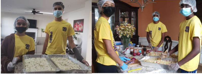
Edison leads made 50 burrito bowls and delivered to the Ozanam Shelter