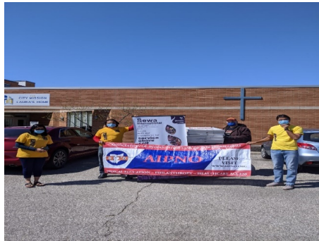
Laura Homeless Shelter