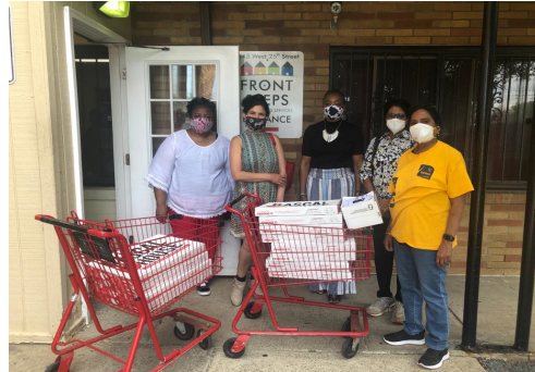
Front Steps Shelter