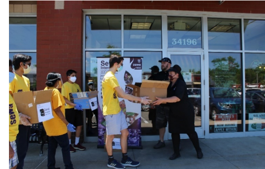
Subway, Solon, Ohio