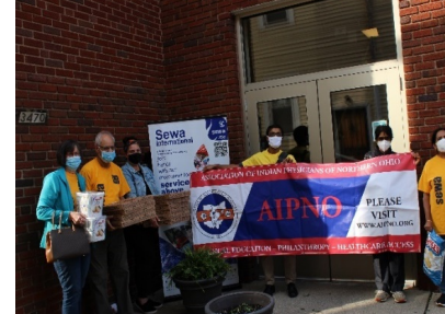
Family Promise Shelter