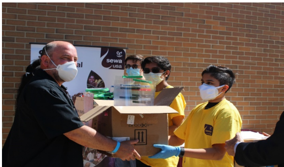
Menorah Park Nursing Home Beachwood

https://www.news5cleveland.com/news/continuing-coverage/coronavirus/local-coronavirus-news/local-teenagers-3d-printing-hundreds-of-face-shields-for-frontline-workers