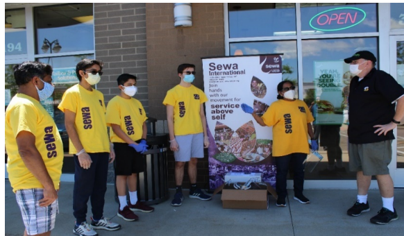
Antonio's Pizza, Solon, Ohio