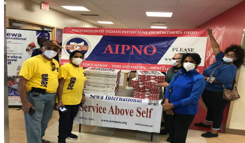
Zelma Homeless Shelter