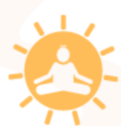
Kriya Purification Techniques