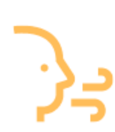
Pranayama Controlled Breathing