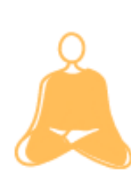
Bandhas Body Locks