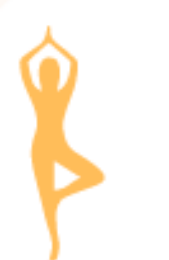
Asanas Physical Poses

A week-long, in-person, hands-on, training during the 1 st , and, the 3 rd semesters at our campus in LA.