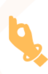
Mudras Hand Gestures