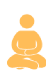
Dhyaana Meditation Practices