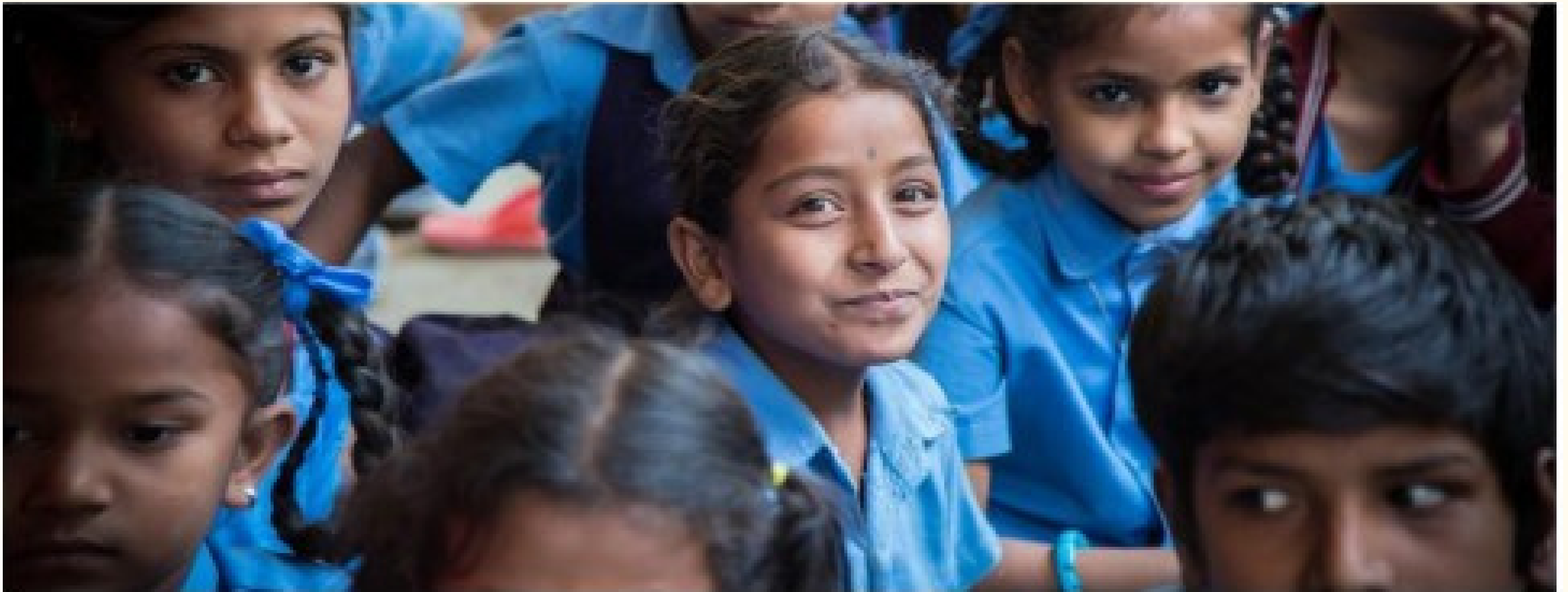
The 'SHE' Project -- Sanitation, Hygiene, and Empowerment -- focuses on building toilets in government and non-profit schools in India.

Sewa International's 'SHE' project for the girl child was conceived to provide sanitation and hygiene facilities for underprivileged girls who belong to vulnerable sections of Indian society. Along with sanitation facilities, the program focuses on menstrual hygiene, education, and empowering women and girl child through skill development workshops. Here, is an Impact Story from "108 Impact Stories" - Google for Toilets: Some of North Karnataka's Successful Projects.