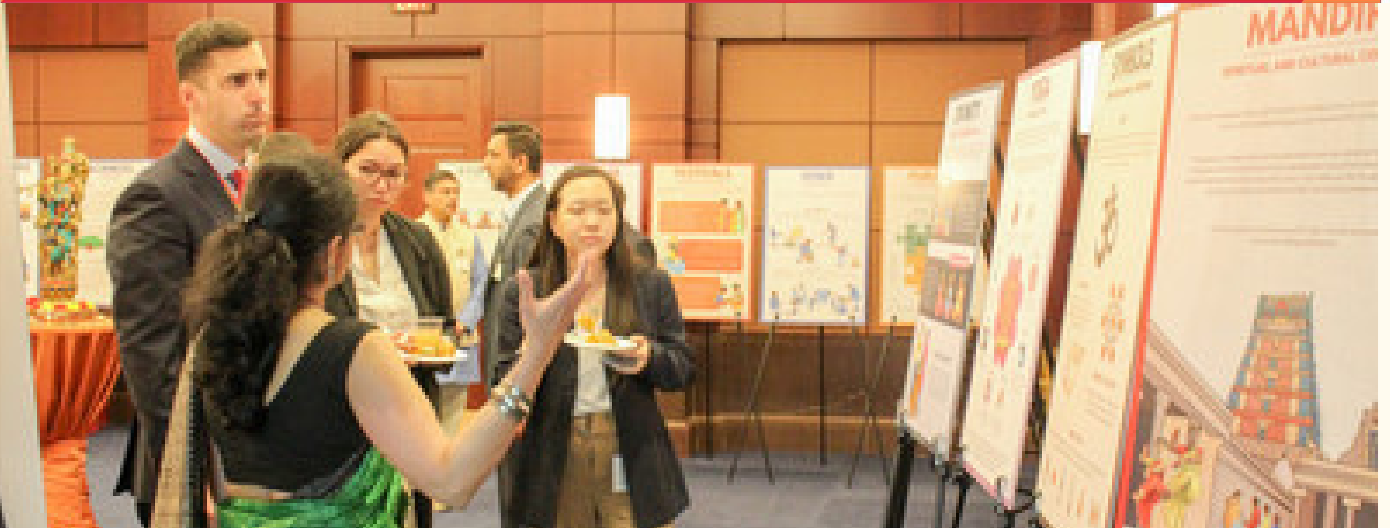
A volunteer describes the posters on display at the 'Darshana' exhibition on Hindu civilization at the Capitol in Washington D.C., May 2022.

Darshana – a Glimpse into the Hindu Civilization is a traveling exhibition that provides a close look at many aspects of Hindu civilization. Designed and developed by the volunteers of Hindu Swayamsevak Sangh (HSS), a non-profit, voluntary, cultural and community organization, 'Darshana' was hosted in 200 cities across the United States.