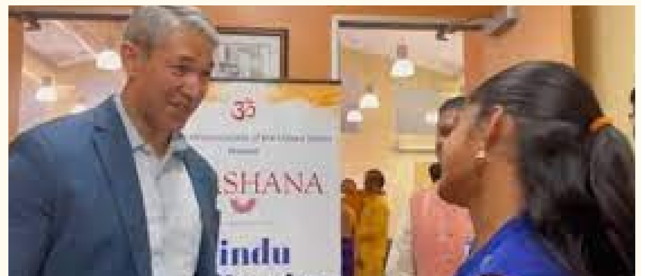
A visitor listens intently to a volunteer at the 'Darshana' exhibition at the Capitol in Washington D.C.

Ancient Hindu civilization had world-renowned schools and universities that catered to a diverse student body, where various sections of the society were well represented, and established forms of leadership where women could obtain positions of power and leadership.