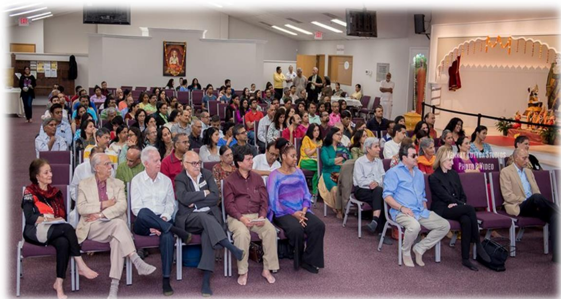
Close to 200 people attend the event