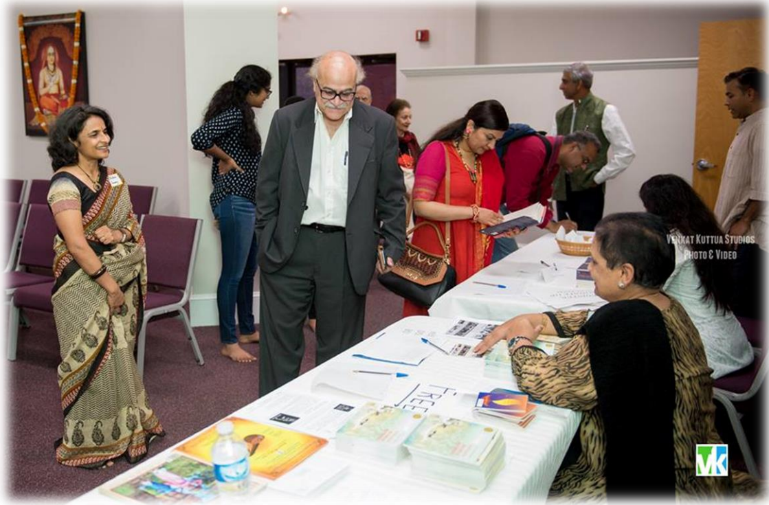
People Registering for DVD's

In the present times Yoga has established itself as an effective alternative therapy across the world. Modern Masters are improvising and selling it with different brand names and even patenting them. It has become increasingly difficult to find authentic knowledge about Yoga; therefore it was decided to document the History and Philosophy of Yoga on film media. This is the first ever film in the world on History of Yoga.