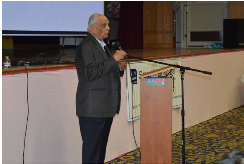
Speakers and Reception Desk