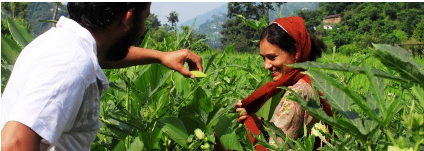
A woman agriculturist in the field

To help underserved communities of Rudraprayag and Chamoli districts in the State of Uttarakhand recover from the devastating floods of 2013, Sewa initiated various interventions over the last five years.