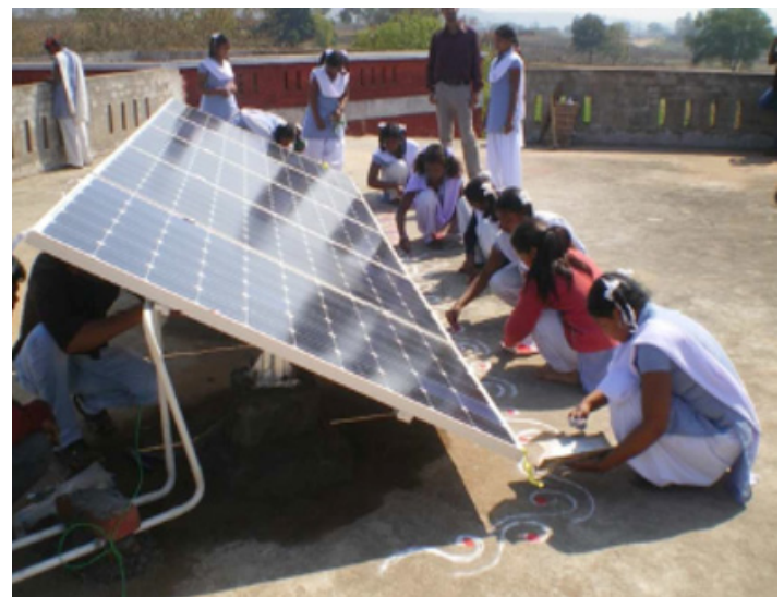
Solar panels installed at Chitrakoot, Madhya Pradesh

A five-KW solar plant meeting the lighting and drinking water purification requirements of 200 students of the Vanavasi Sewa Prakalp has been installed in Odisha. The success of this project led to its replication in six other schools in rural Odisha. The project was executed in collaboration with the Oil and Natural Gas Commission (ONGC) of India. Innovative concepts like “ Solar Village ” with grid/off-grid plants are being explored.