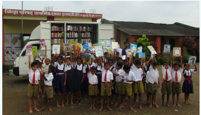
Library on Wheels

Over the last 25 years, Sewa International has matured into executing and managing long-term comprehensive rehabilitation and developmental projects in various parts of India and beyond, delivering sustained benefits to the affected communities. Today, Sewa International has presence in 22 countries across the world focusing and executing projects addressing local issues, promoting volunteerism, and supporting a broad range of development projects. In India, Sewa International has worked on 14 disaster rescue and relief activities, and some multi-year rehabilitation projects. In the most recent floods that affected the entire state of Kerala, Sewa worked with