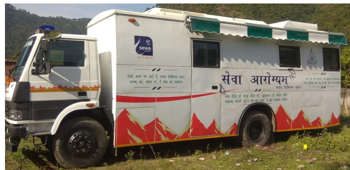
Mobile Medical Van – "Sewa Aarogyam"

To promote eco-tourism, Sewa organized training for local young men and women to become tourist guides. Sewa also offered training in adventure sports and helped them discover new / less travelled trek routes that would be a source of their livelihood.