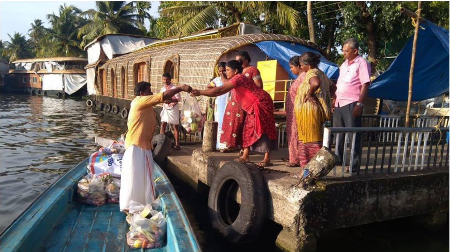
Relief material distribution after Kerala Floods

local partner organization, Deseeya Seva Bharathi Keralam , in rescue and relief efforts. Sewa sent five truckloads of relief material from as far as New Delhi to Kerala. Sewa also mobilized a team of doctors who travelled to Kerala and conducted medical camps across the flood-hit region for an entire week. The rehabilitation phase has started, and the first project of installing three community-owned Reverse Osmosis Water Treatment plants at three locations in Alleppey district has commenced. This self-sustaining project will benefit 3,800 people from 735 families over the next five years.