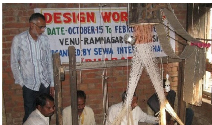
Participants at a weaving workshop in Varanasi

programs. Promoting traditional Kashi handlooms, handcrafted with beautiful brocade designs fused with Kutch embroidery, has brought out a unique product range for consumers.