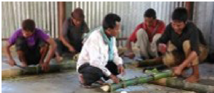
Bru tribe members making bamboo furniture

Despite its strategic location, as it shares borders with three countries -- Bangladesh, China and Myanmar -- Northeast India is arguably the most neglected part of the country. In 2016, Sewa began sustainable interventions in skill development, healthcare, and education.