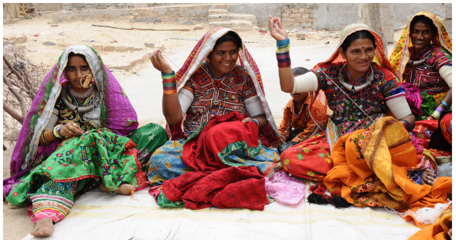
Rural women trained in traditional Kutch handicrafts

The Center provides training in tailoring and traditional Kutch handicrafts to unskilled rural women. To empower local Kutchi artisans, Sewa provides support for marketing their products. Today, 25 women from nearby villages are directly employed by the Center and over 600 are on contract work, based on their specific skills.