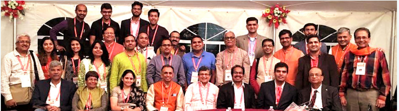
Sewa Team at World Hindu Congress 2018, Chicago.

The Second World Hindu Congress was held in Chicago to mark the 125 th anniversary of Swami Vivekananda's historic speech at the Parliament of World's Religions in 1893 . More than 2,500 delegates and 250 speakers from over 60 countries participated in the three-day event.